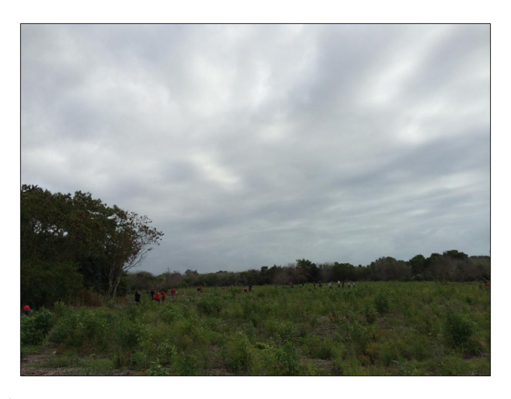
Groups of volunteers worked diligently to plant Muhly grass on a cool and breezy Saturday morning.