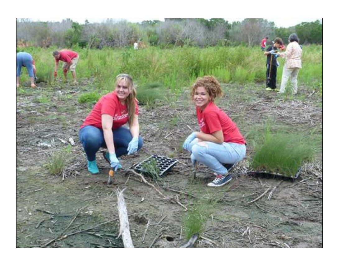
Wells Fargo volunteers are making a difference on a Saturday morning restoring coastal freshwater wetland along Biscayne Bay.