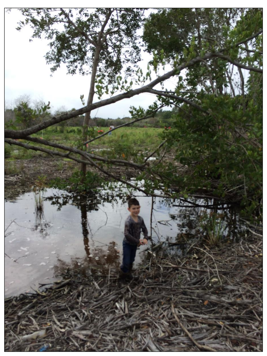
Volunteering is for everyone!